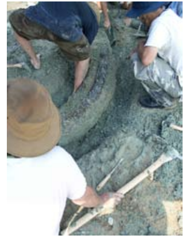
Tusk nearly ready to jacket.