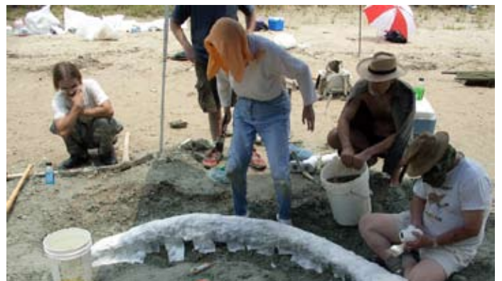
Tusk being prepared.