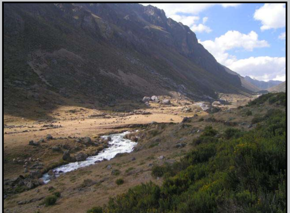
The Santa Eulalia River Valley along transect 1.