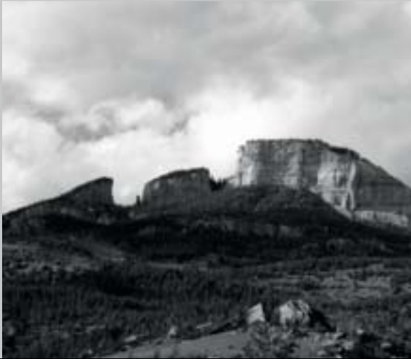
Bighorn National Forest in north-central Wyoming

Matt crisscrossed the western Great Plains and eastern Rocky Mountains in his trusty Toyota Tacoma searching for small blue birds. Some locations, like the Little Missouri National Grasslands in western North Dakota, provided stunning scenery and plenty of birds, others, like Thunder Basin National Grassland in eastern Wyoming, proved to be little more than 'public' grazing lands and oil fields. In and around the Black Hills National Forest in western South Dakota Matt collected the museum's first putative hybrid Passerina individuals. Brilliant blue with white bellies and wing bars, hybrid males have been described as looking like Mountain Bluebirds with wing bars and appear to be intermediate between the two parental species in nearly all morphological traits. Now, Matt is busy in the lab trying to tease apart the relative genetic contributions of the two parental species to these hybrids.